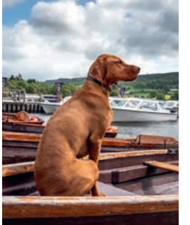
GRID REF: E9