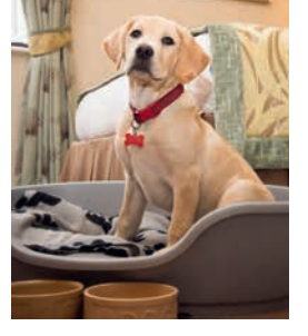
GRID REF: D7