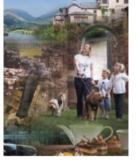
www.cumbriaslivingheritage.co.uk GRID REF:Various

We believe that our four-legged friends should also enjoy great days out in the Lake District. So, you will be delighted to know that we have plenty of places where your dog is very welcome too gardens, historic houses and museums with walks in abundance!