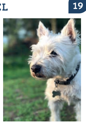
GRID REF: F9

www.lindeth-howe.co.uk Lindeth Drive, Longtail Hill,