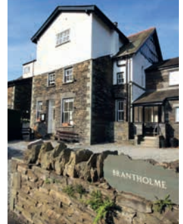
GRID REF: F9