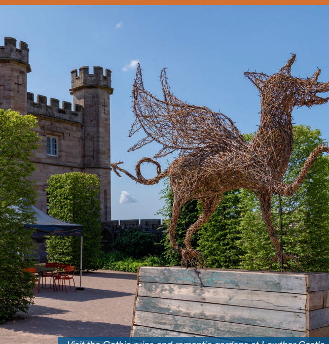
Visit the Gothic ruins and romantic gardens at Lowther Castle

After a few days spent exploring the Lake District by foot, bike, and public transport, it's time to hop on the train or bus and head for home. You can extend your stay and location hop using the Stagecoach bus services if you prefer.